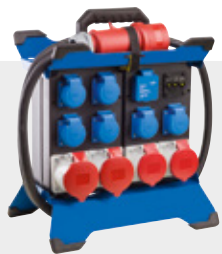
STECKY DUO 3