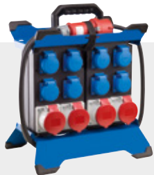
STECKY DUO 1