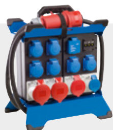
STECKY DUO 4