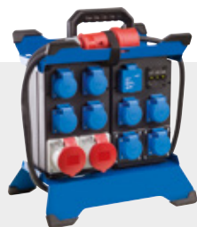
STECKY DUO 2