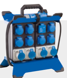
STECKY DUO 5